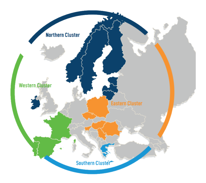
Fig. 2. OneNet cluster and participating countries

The project involves different market participants, and different service-product combinations are tested, both transmission system operator and distribution system operator products are involved. The overall concept is tested in 4 clusters at several pilot sites (Figure 2).