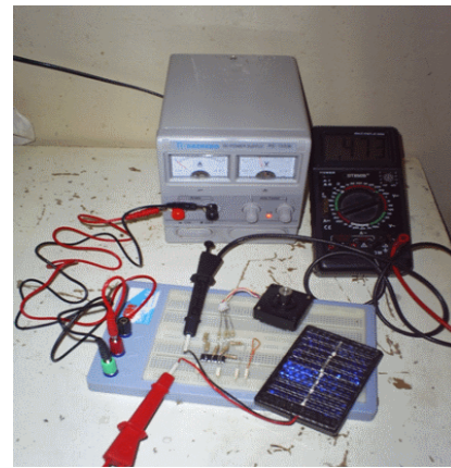
Fig. 2. Testing the proposed Neural Network.