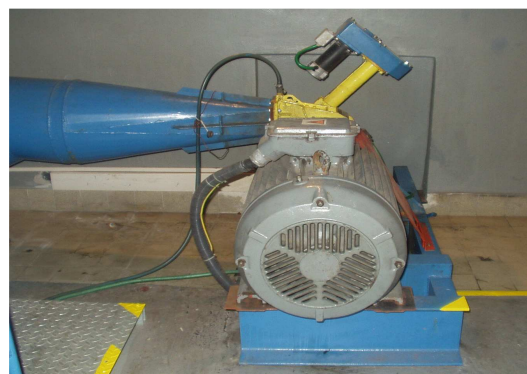
Fig. 2. SHS utilizing potable water flow from water reservoir to water pipeline

Similar is utilizing of head during potable water flow from water reservoir to water pipeline. Example of such a SHS is in Fig. 2.