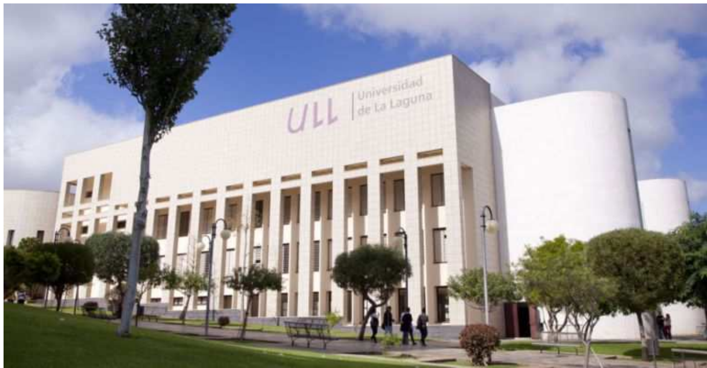
Picture 3. Building where the ICREPQ'25 will take place

3.- The tram stop of Campus de Guajara is in front of the conference building, picture 3, you only need to cross the street.