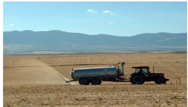
Fig. 1. Traditional way to apply pig slurry to the fields.

Castelló interior northern shires where the pig slurry is a real problem. The agricultural lands in some villages have no enough surfaces to spread out all the pig slurry produced in their farms (since the maximum quantity of residue to dump in the fields is regulated).