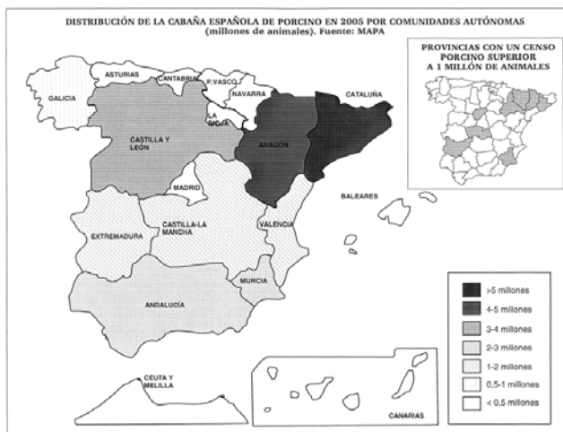
Fig. 2. Distribution of the Spanish Pig Population in the different autonomous communities.

Referring to the Spanish pork sector, it meant along 2005 an overall volume of trade of 4459'7 millions of euros, supposing the 31'3% of the total final cattle production. This economical sector employs among 130000 and 150000 workers directly or indirectly. The number of pigs entered in the accounts last year got up to 24889 thousands of animals (decreasing a -0.03% referring to 2004). This amount represents the 16.4% of the total European number. The Spanish pork production in 2005 reached the 3164000 Tones (-0.4% referring to 2004), the 15% of the total European production [6].