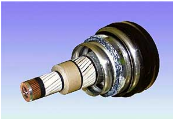
Fig. 3. Single-core HTS cable (Furukawa Electric Co., Ltd.)

High temperature superconducting materials exist for a long time. Theoretically, superconducting materials could be used for almost all electric equipment in the power grid. HTS cables have no electrical resistance. The losses are therefore significantly lower compared to conventional cable. However, the cost to maintain operating temperature is very high. Moreover, the capital cost of the superconducting materials and the cryogenic equipment is also very high. Further R&D will drive the costs down, but large scale integration of superconducting technology in the grid is not to be expected on short term. From an ecological point of view, HTS cables are more interesting than oil-filled or gas insulated cables. HTS cables are environmentally friendly [13]. Figure 3 shows a single-core superconducting cable.