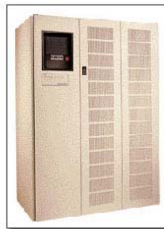
Fig. 1 Outside view of an UPS system

In the design of the sources, notice that they are not built self-sufficient in addition to their necessities to make them more powerful and perfect in their functions, so that it is much more usual to find in all activity areas that correct operation is absolutely depending on the supply of their units and reference instruments.