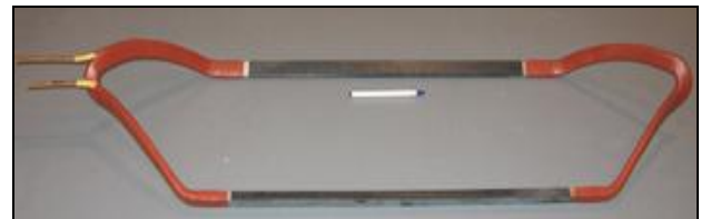
Fig. 1. 6kV form-wound modelled coil

All the components of the coil were accurately represented in the models. Figure 1 shows a photograph of the modeled coil. A simplified representation of the bi-dimensional models is shown in figure 2.